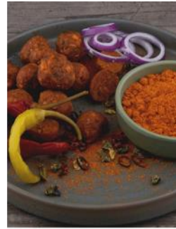
Balls on Fire